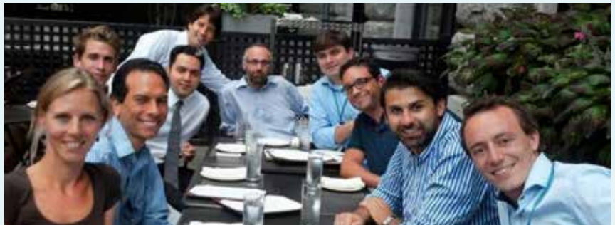
Farewell Dinner for Departing Fellows, Liberty Hotel, Boston, MA